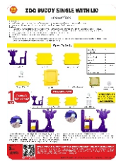
Instruction Manual x 1