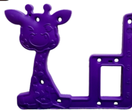
Side Panel x 1