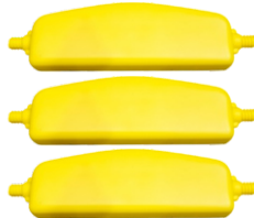
Support Bar x 3