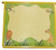
Lid x 1