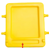
Table Top side with rectangular indentation oriented towards the front

Take the table top from the packaging, align the two pins on one of its longer edges with the corresponding slots on the side panel of the subassembly (step 2) and secure them together (step 2) with two medium nuts.