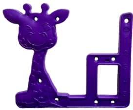
Side Panel x 2