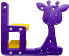
Subassembly (Step 1)