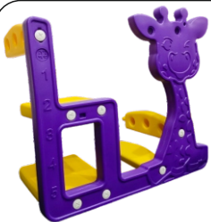
Subassembly (Step 2)