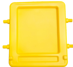
Table Top x 1