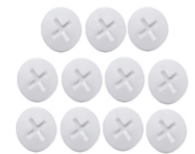
Medium Nut x 11