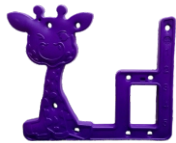
Side Panel x 1