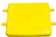
Seat x 2