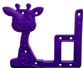
Side Panel x 2