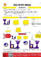
Instruction Manual x 1