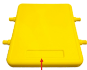
Table Top Side with rectangular indentation oriented towards the front

Take the table top from the packaging, align the two pins on one of its longer edges with the corresponding slots on the side panel of the subassembly (step 2) and secure them together (step 2) with two medium nuts.