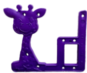
Side Panel x 1