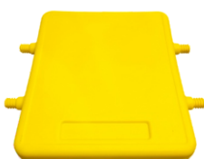
Table Top x 1